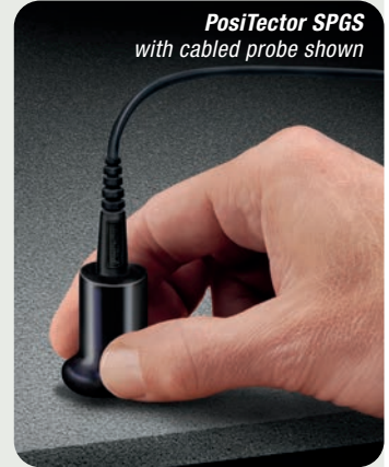
PosiTector SPGS with cabled probe shown

Probe mounted on a 1m/3ft cable for enhanced ergonomics and access to hard-to-reach areas