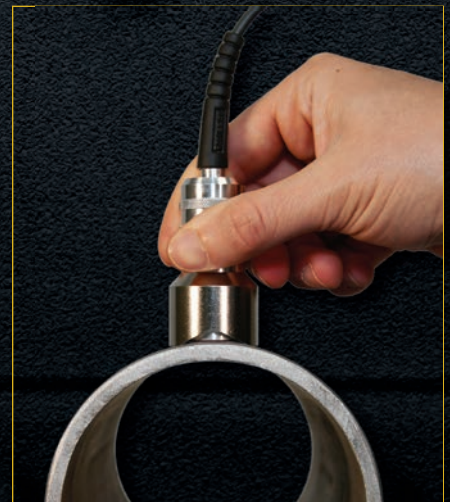
PosiTector SPG OS surface profile probe for outside diameters