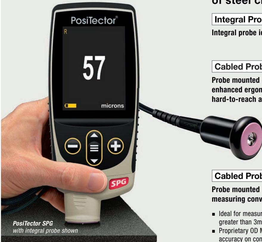
PosiTector SPG with integral probe shown

Ideal for measuring the surface profile of steel cleaned by abrasive blast