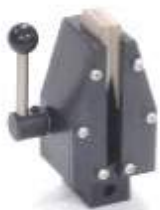
Manual Grips (Film - Fabrics - Sheets...)