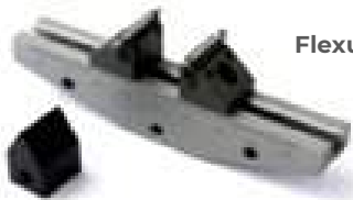
Flexure / Bending Fixtures