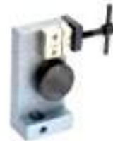
Bollard type Grips (Threads - Ropes - Wires Fine Ductile Cables ...)