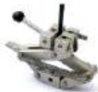
Self-clamping Grips (Elastomers - Rubber...)