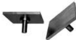
Compression Plates Square - Rectangular - Circular