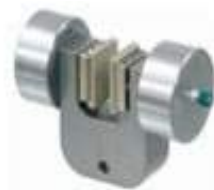
Pneumatic Grips (Film - Fabrics - Sheets...)