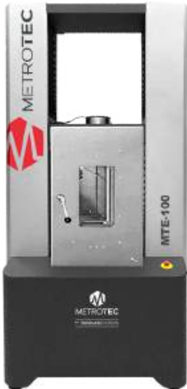
Thermal Test Chambers at different temperatures