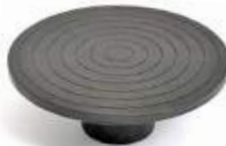
Compression Plates Square - Rectangular - Circular