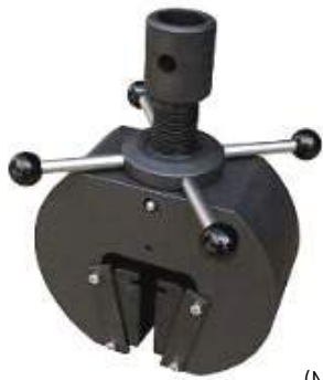
Wedge-type Grips (Metals - Plastics - Wires - Cables - Composites...)