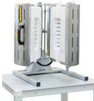
High Temperature Test Furnaces (Between 1100 and 1500 °C)