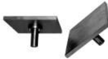
Compression Plates Square - Rectangular - Circular