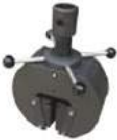
Wedge-type Grips (Metals - Plastics - Wires - Cables - Composites...)