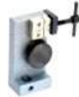
Bollard type Grips (Threads - Ropes - Wires Fine Ductile Cables ...)