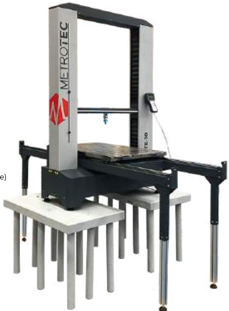
Customized MTE-10 Universal Testing Machine with a special design to perform tests on samples and components for automotive industry - T-Slotted base plate and movable on rails - Load cell movable on the upper crosshead.