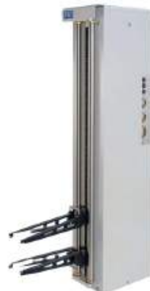
Extensometers High Elongations