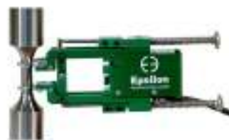
Extensometers Small Elongations