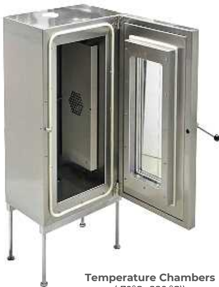
Temperature Chambers (-70°C +280 °C)